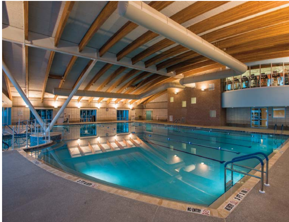
Sun-N-Fun Lifestyle Wellness Center - Sarasota, FL (Tectum IIIP Roof Deck)

Tectum IIIP roof deck is made of the same components as Tectum III, but with an edge detail specifically designed for use over high-humidity applications such as swimming pools and ice arenas. The detail, when properly sealed with urethane adhesive, provides for a continuous vapor retarder from panel to panel in all directions. Tectum IIIP provides optimal insulation and a nailable surface for high-humidity environments.